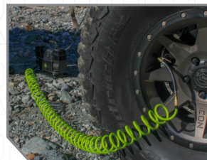
24" COILED HIGH-QUALITY HOSE