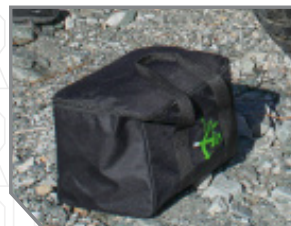
BALLISTIC NYLON STORAGE BAG INCLUDED